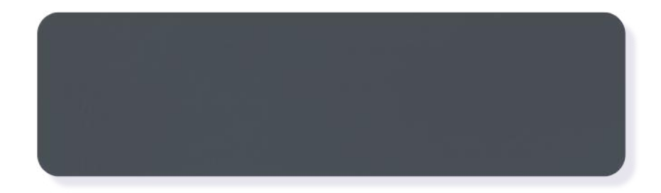
FINISH 01 - Perfect Smooth For unicolours only.

PROMATT is available in the following surface structures, according to the type of decor: