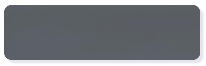
FINISH 09 - Ultra Smooth For print decors only - woodgrains and fantasies.